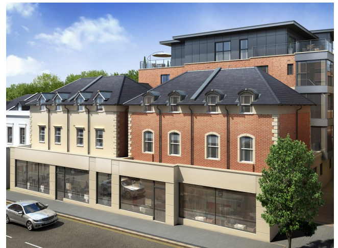
Computer Generated Image of Completed Scheme

This self contained ground floor unit forms part of a prestigious new mixed use development in Surbiton town centre and comprises approximately 2,500 sq ft.